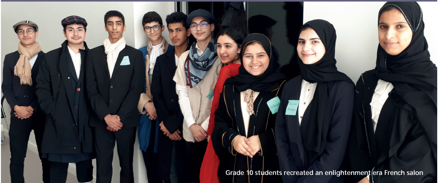
Grade 10 students recreated an enlightenment era French salon