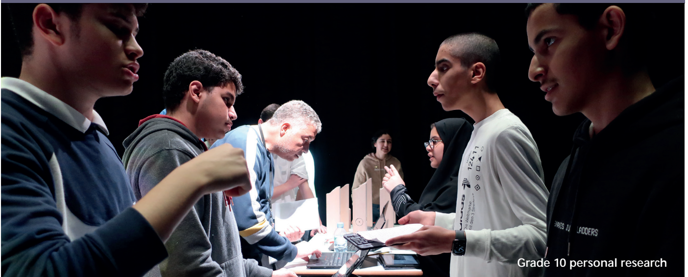
Grade 10 personal research